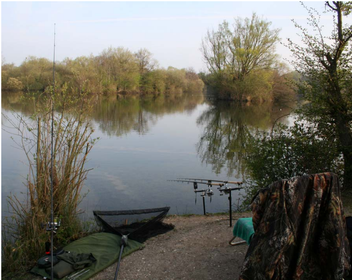
Early Spring Tenching

rarely stay overnight as the fish stocks are very nomadic. Better to get a decent night's kip in a decent bed and pick a new area at dawn the next day fully refreshed. Make sure you are at your chosen venue before first light and take a look for signs of fish activity such as bubbling or rolling. This is the best time of day to see your target fish. So don't be in too much of a hurry to set up! If you are camping make sure you set that alarm for 3.45am and take a good squiz at the lake. Don't stay in bed like the carp boys!!!!!!!!!!!!!!