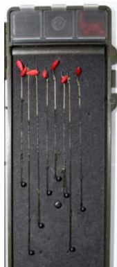
Suffix Camfusion /Combi Rigs

If I am using smaller size 12 and 14 hooks then my choice without exception is Suffix Camfusion 10lb bs. This coated braid strips easily and has an unobtrusive finish. It lies flat (you should tank test all your rigs) and does not need steaming with very little memory. The combi rig adds confidence in that braid tangles are a thing of the past and you have a superbly reliable set up. Full marks to Gardner for a fantastic product.