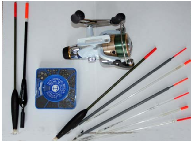
A Selection Of Pit Floats.

Making the move from canal or estate lake to pursue the larger gravel pit specimens really does not require a lot of specialist kit. In fact you will likely have most of the gear already. In Part 2 I look at some of the terminal kit I use and open up my tackle box to inspection! Some handy tactical tips are also provided for the gravel pit newcomer.