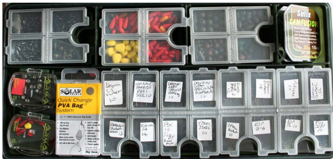
Korum Rig Manager. A place for everything, and everything in its place!

Tip: Be ruthless about what you take and get everything organised in multi partition boxes. Surplus larger items such as spare feeders can go in the rig roll along with a few spare leads, rig tools etc. Otherwise everything else is in the Korum box. You do not need to drag 4lb of leads around with you! So cut those back as a first priority!