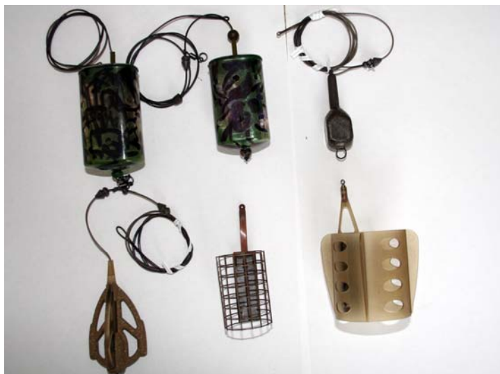
Top Row: 2.5oz maggot inline, 2oz maggot inline, PVA bag heli' rig